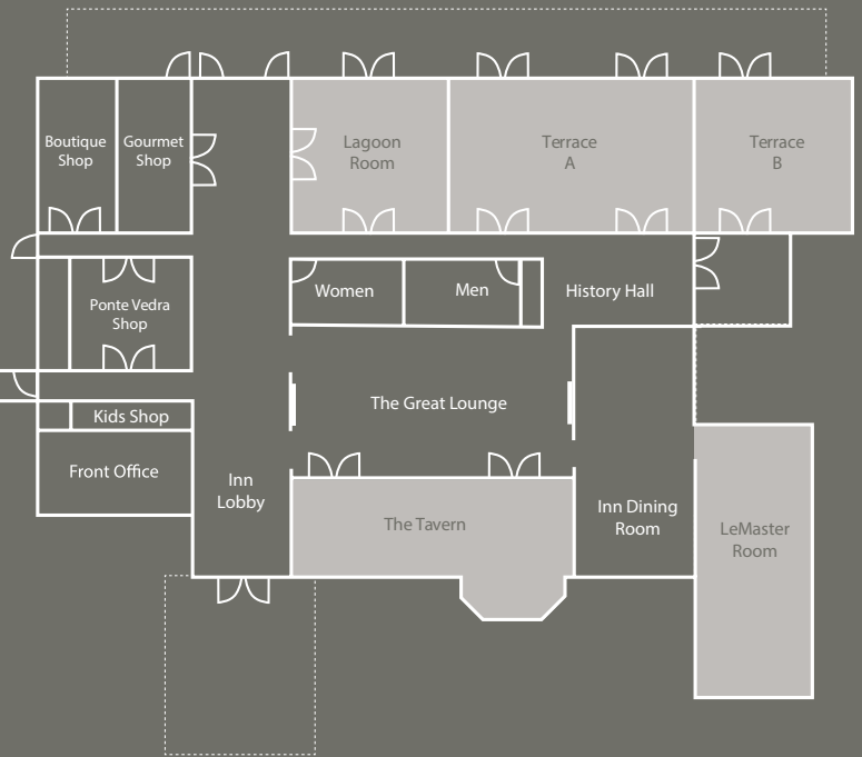
Overlooking Golf & Lagoon